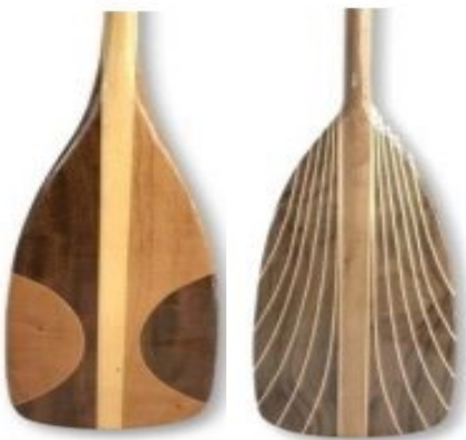
Custom wood—many styles possible