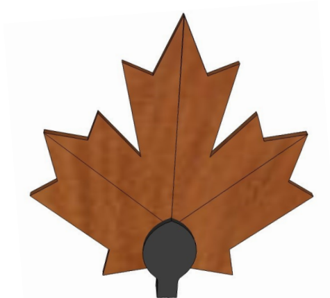
Custom wood—Custom Shape