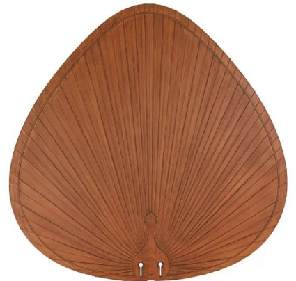
Composite Palm Leaf