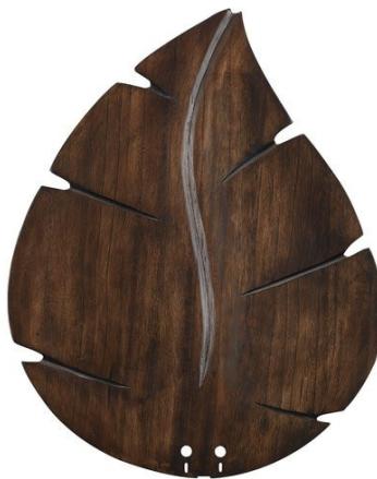
Carved With Walnut Finish