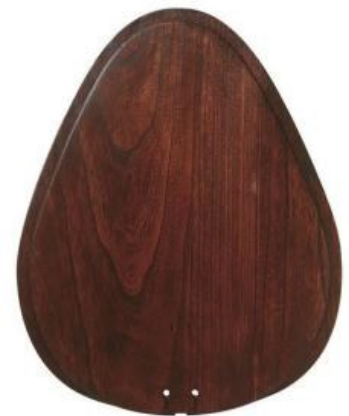
Wood with Walnut Finish